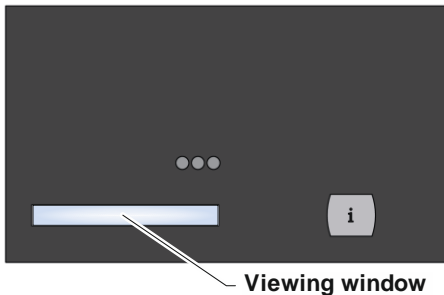
Fig. 1: Keyboard