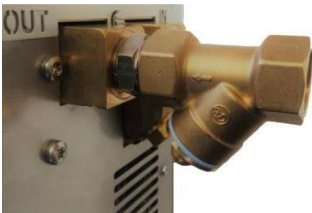
Fig. 1: Connection for Thermo-5 units